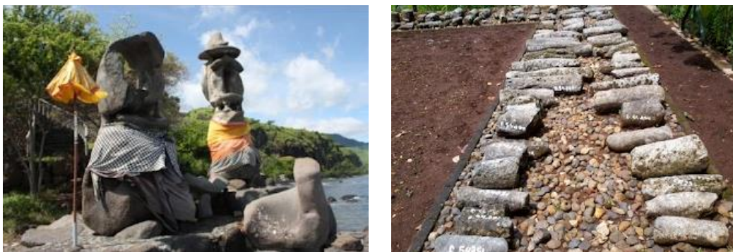
Figure 2 & 3. Historical heritages in Sembiran

Traditional life such as local traditions, rituals, and ceremonies are still run by Sembiran villagers although technological advances have been spreading to the village. Arts and customs are still preserved in this village until now. Sacred dances are still performed in certain ceremonies both in family and community context, such as Rejang Sembiran , Baris Dadap , Baris Presi , and Baris Jojor . The dances are performed only on special days by selected groups of people. Another unique characteristic of Sembiran is their old houses, which still can be found in the village. There are also many historical heritages in this village that are believed to be more than 2,000 years old. 17 out of the 20 temples in the village have a number of Megalithic relics, as can be seen in the following pictures.